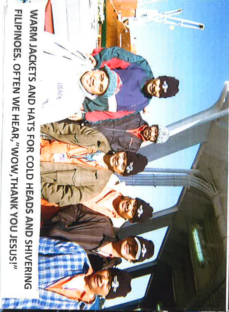
WARM JACKETS AND HATS FOR COLD HEADS AND SHIVERING FILIPINOES. OFTEN WE HEAR, "WOW, THANK YOU JESUS!"