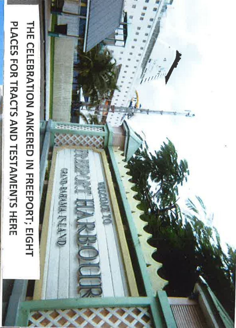
THE CELEBRATION ANKERED IN FREEPORT; EIGHT PLACES FOR TRACTS AND TESTAMENTS HERE